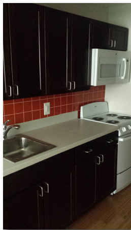
The 55 studio units at Echo Place boast amenities including modern kitchens with tile backsplashes.

A tour of Echo Place reveals why both clients and staff are excited about the new residence. Having opened its doors on July 13, it boasts a community room and gallery space where its 47 residents can watch TV and play cards, as well as a conference room for staff meetings, and a large kitchen where residents can enjoy cooking lessons together. Echo