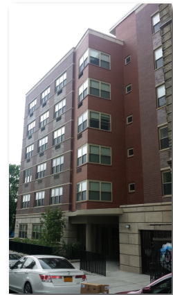
Echo Place in the Bronx is the latest addition to the PCMH residential portfolio.