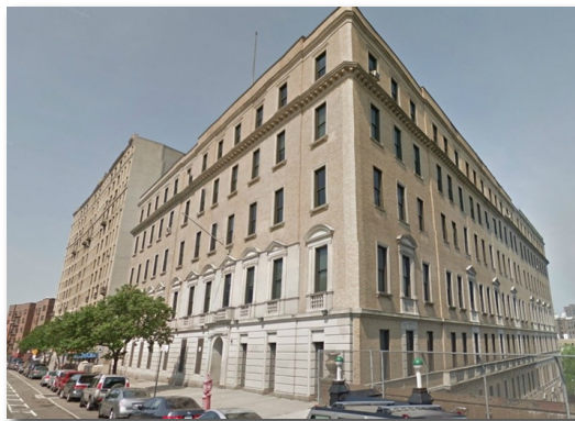
Three PCMH programs have relocated to spacious new offices at 1775 Grand Concourse in the Bronx.

PCMH's Bronx Child and Adult Clinic has taken on a new dimension since its move to the 8 th floor of 1775 Grand Concourse from 97 th Street in Manhattan last May: formerly known as the Postgraduate Center Child Mental Health Clinic, it expanded its license to serve both adults and children.